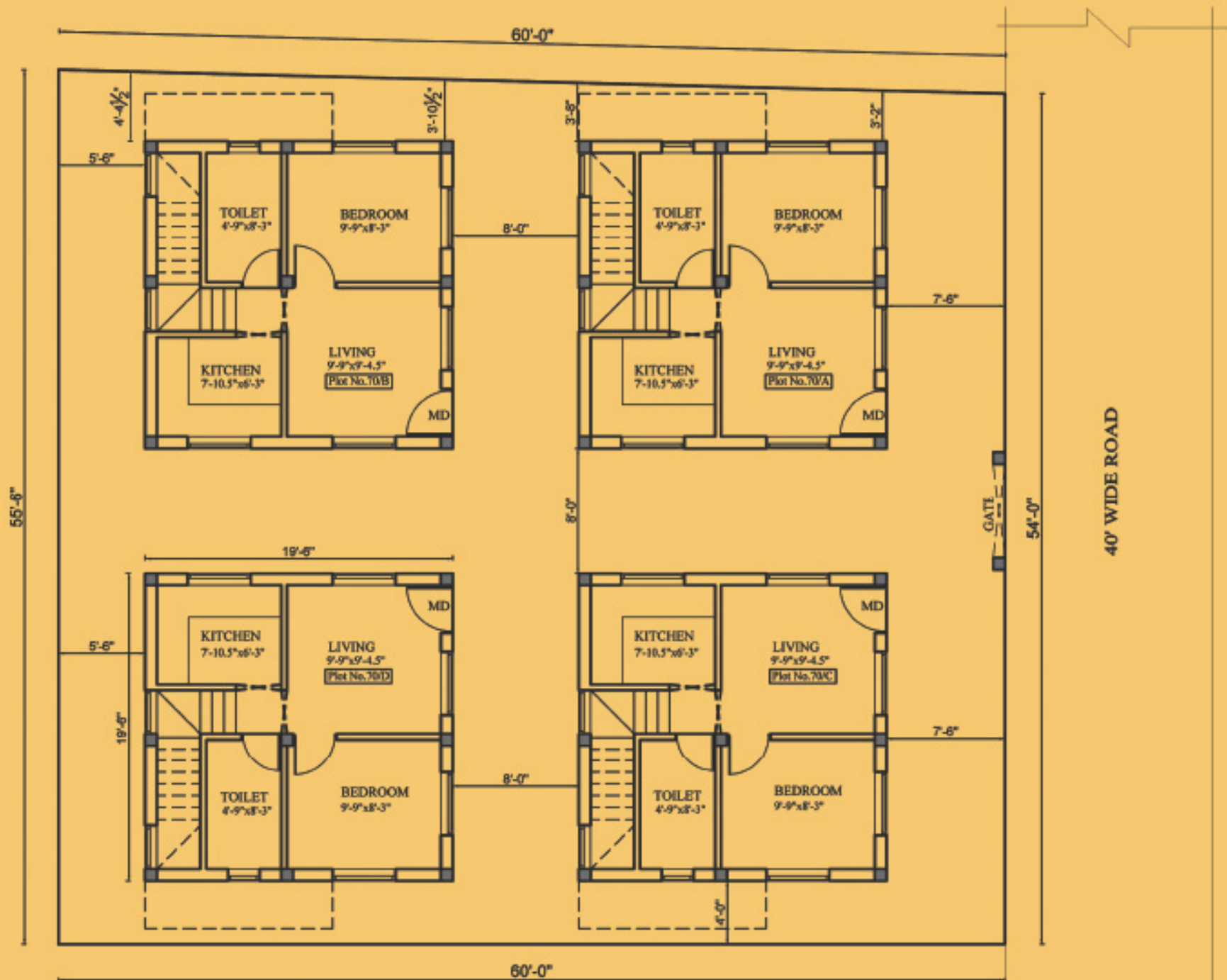
GROUND FLOOR AREA OF EACH UNIT - 380.25sq. ft.